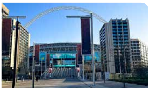
Entrance Inner Circle och Centre Circle

Music events: Varies for each event, but always somewhere at Level 2.